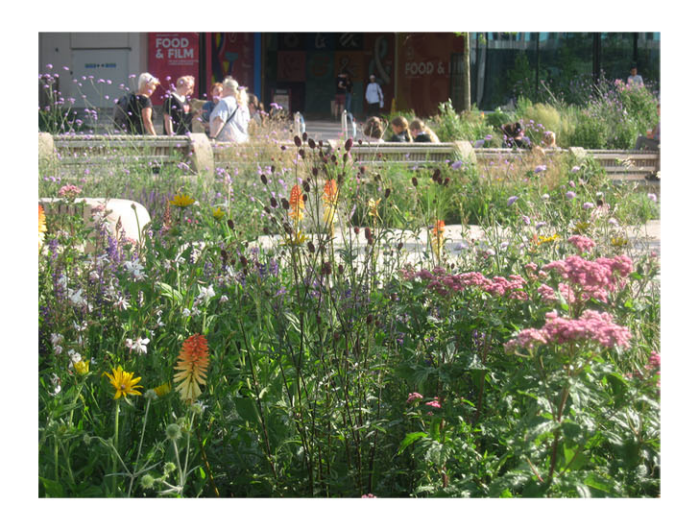
Use the planting to create spaces & places that feel more human in scale, which help create a more comfortable resting environment