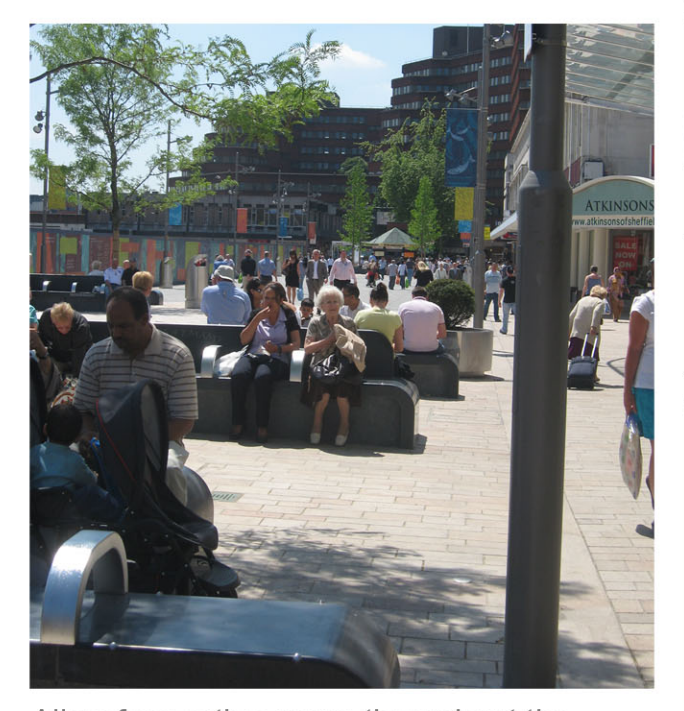
Allow for seating areas throughout the whole project area, helping provide life, animation & rest within the High Street