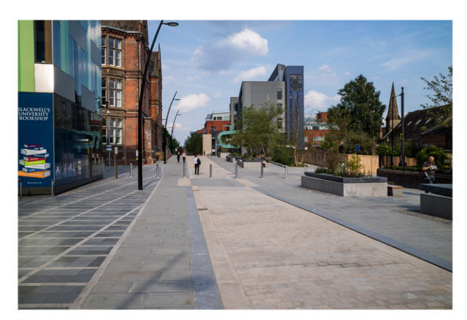
New combined cycleways & servicing routes at the University of Sheffield