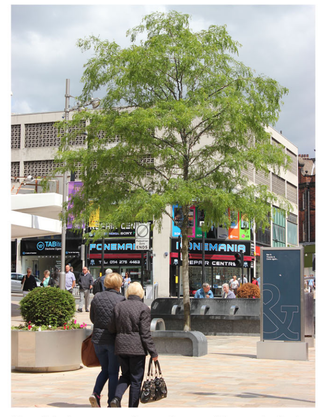
Provide increased numbers of trees to help with city cooling & explore tree species that can cope with the rising urban temperatures