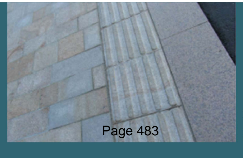
Provide directional tactile markers on key routes throughout the project area