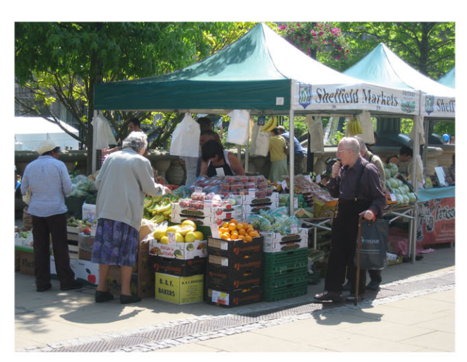
Provide multi-functional spaces that allow large & small events to take place without disrupting the main pedestrian routes