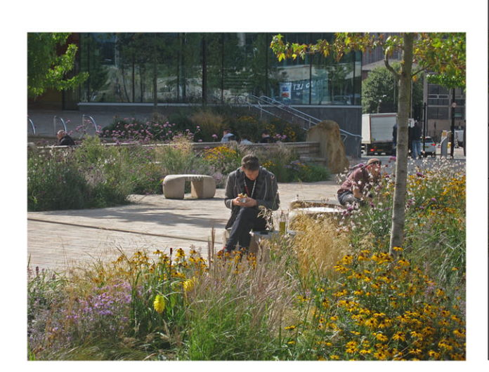
Create intimate spaces for people to rest & relax on their own or within sociable seating groups