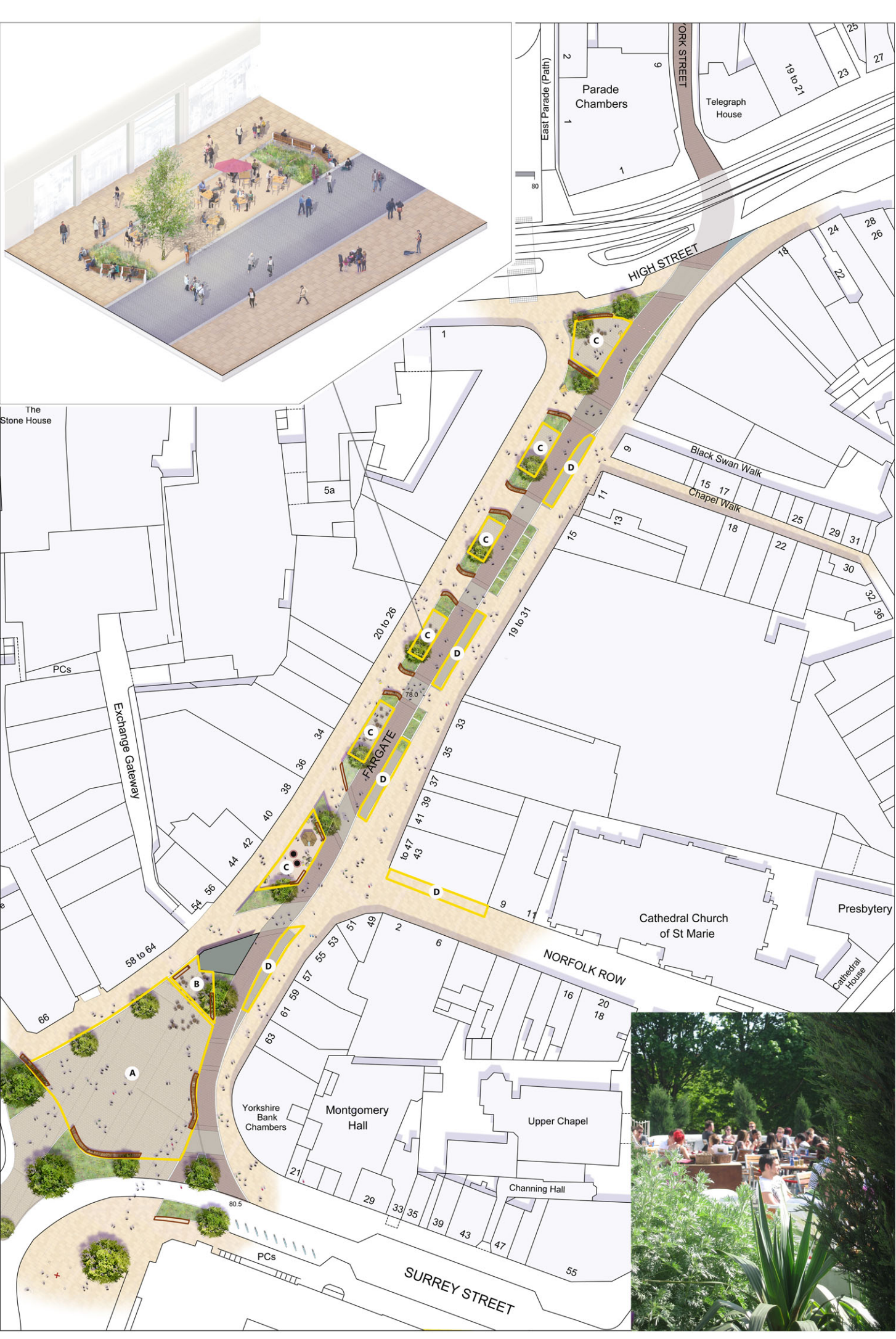
Places to rest & relax that are designed to feel part of the wider streetscape